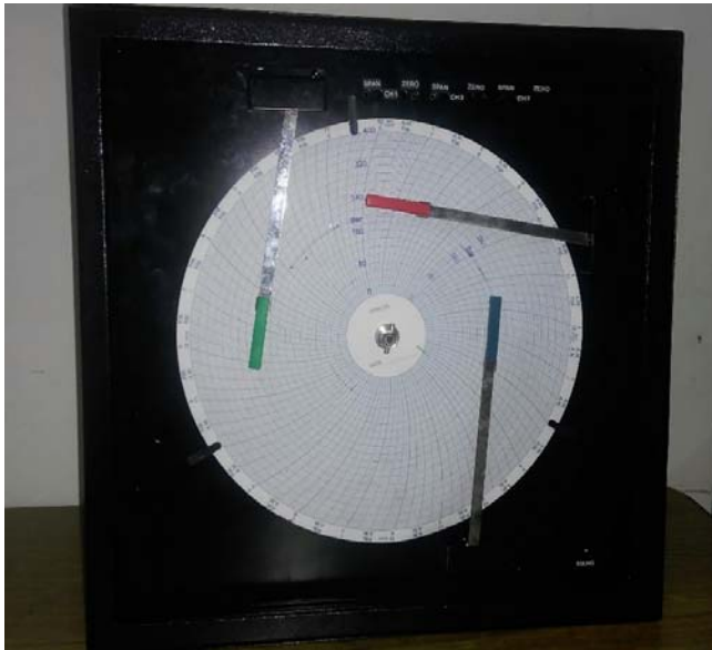
MODEL : C-100R3P