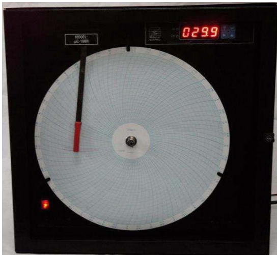
MODEL : C-100RD