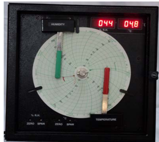
MODEL : C-60RTPD